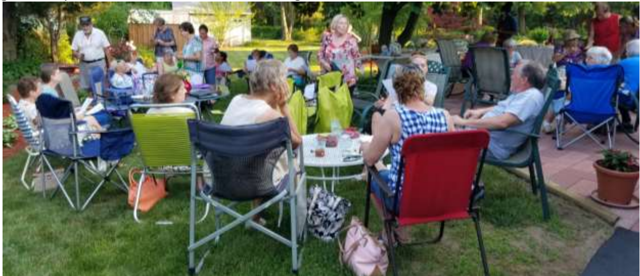
Enjoying the June social meeting in perfect weather!