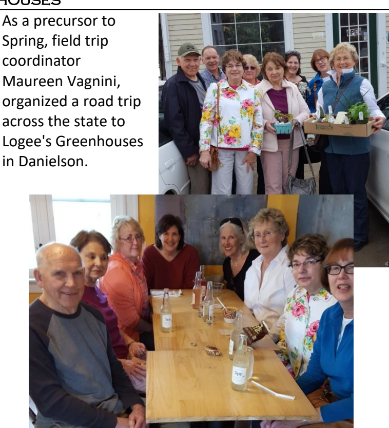
Page 5 and 6 Logee's photos