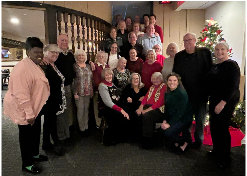
We sure clean up nicely! A very festive crew at the 2023 Holiday Luncheon on Dec. 9, 2023 at the Officer's Club of Connecticut in Hartford.