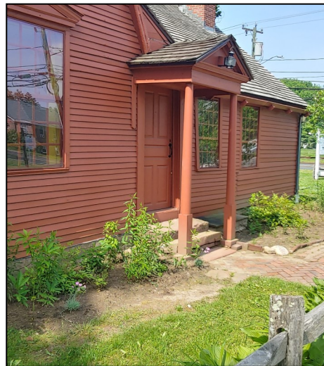
Side entrance to the Strong-Howard House