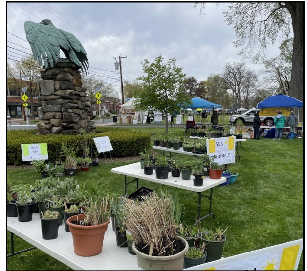
Here we are behind the eagle!

Thank you garden club members for a great spring garden mart. Mark your calendars and plan your plant donations now: the Fall Garden Mart is scheduled for Saturday, October 8, 2022, on the Town Green.