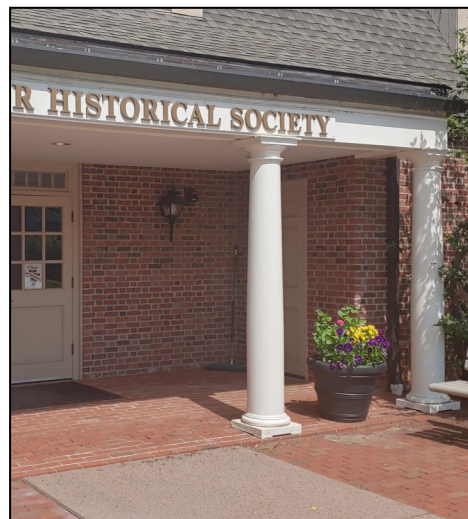
Front entrance to the Windsor Historical Society