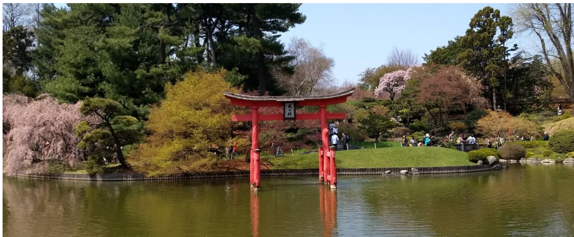
Brooklyn Botanical Garden

Please see the Invasive Plant Information Page on our web site.